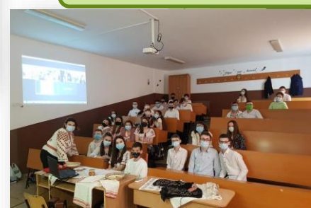
Project "Education at its highest"

"The Night of the Open Books" - at "Humanitas" Bookshop Rm. Vâlcea